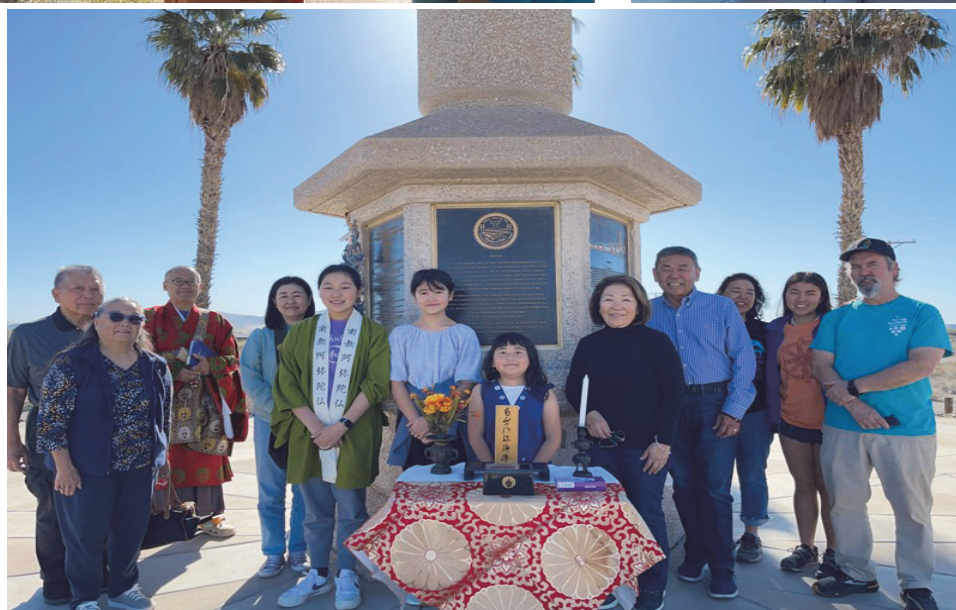
Fresno Betsuin Buddhist Temple